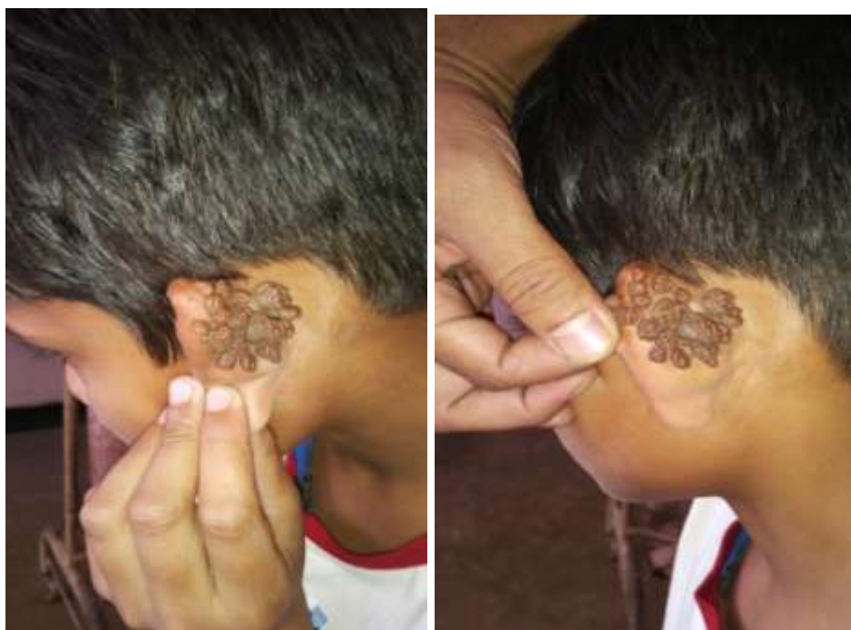
Figure 1 and 2 showing whitish grey plaque with multiple skin coloured to dark brown soft whorled masses over it.

NS is a hamartoma consisting of various elements indigenous to the organ and not merely the sebaceous units. Normal terminal hair follicles are characteristically absent in the lesion although the same may be seen in rest of the epidermis, a feature of diagnostic importance, not usually highlighted in literature. Though malignancy is uncommon, a cautious histological examination is mandatory, especially if there are clinical changes in a lesion.